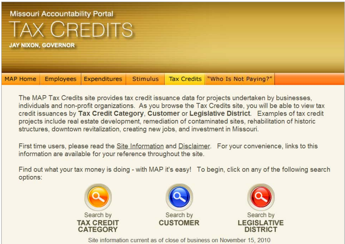
Figure 1. Missouri Accountability Portal

Missouri’s Accountability Portal website allows users to search for tax credit recipients by type of tax credit, recipient (customer) name, and legislative district. ( http://mapyourtaxes.mo.gov/ )